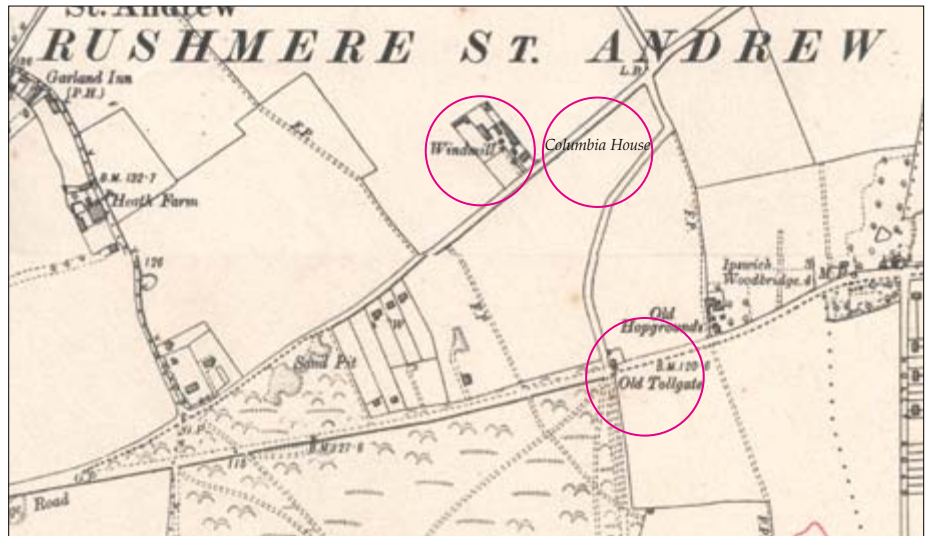
Playford and Woodbridge Roads, circa 1928

The story however, goes on to say that after the show, the house was transported to its present location on Playford Road. Just how much truth there is in this