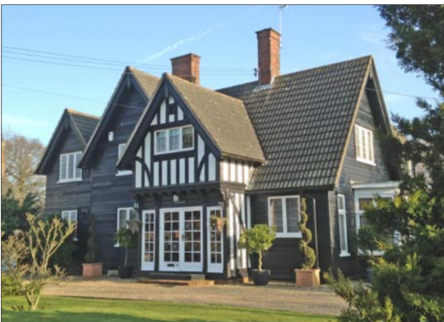
Columbia House, Playford Road, by kind permission of Mrs Frettingham