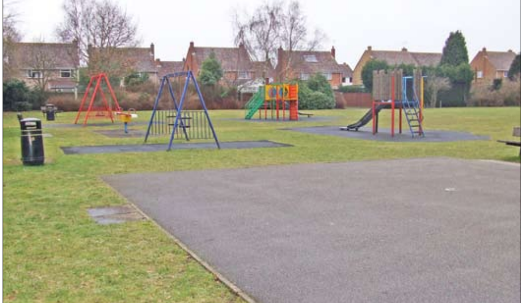
Salehurst Road play area, showing the old basketball pitch in the foreground