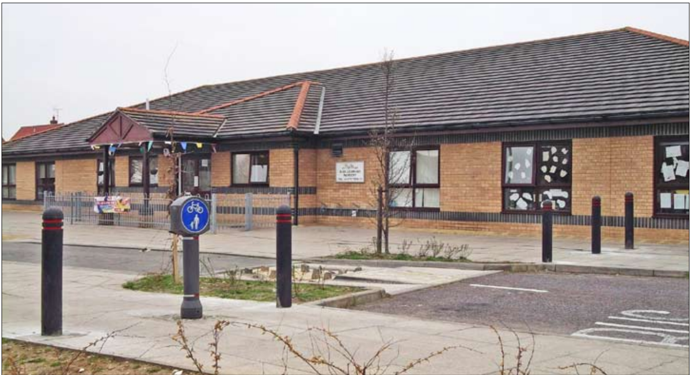
The bollards in place – helping to stop dangerous traffic cutting through by the nursery