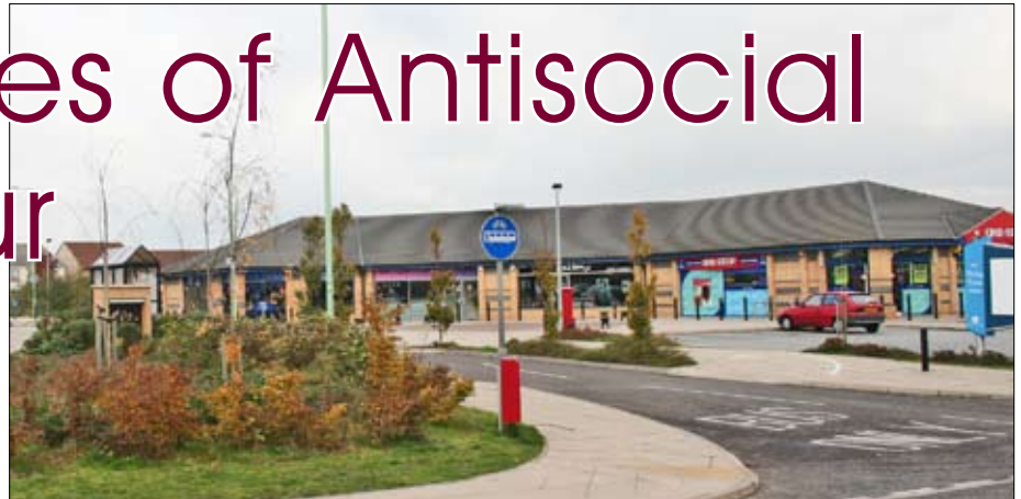
Buses only lane above and below left

Of most concern here are the vehicles which are mounting the footpath and using the plaza as a short cut between Broadlands Way and Brendon Drive. These inconsiderate and thoughtless motorists are driving within inches of the Just Learning Nursery front door just to shave five minutes off their journey time. The message to you is