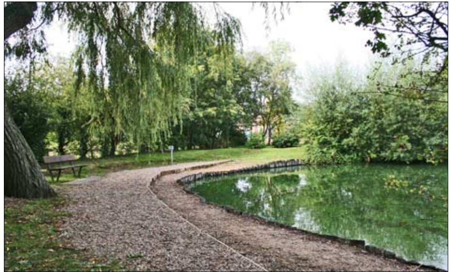
New footway around rear of Chestnut pond

On a slightly brighter note, 'Greenways' under contract for the Parish Council have commenced some refurbishment work at Chestnut Pond with a new