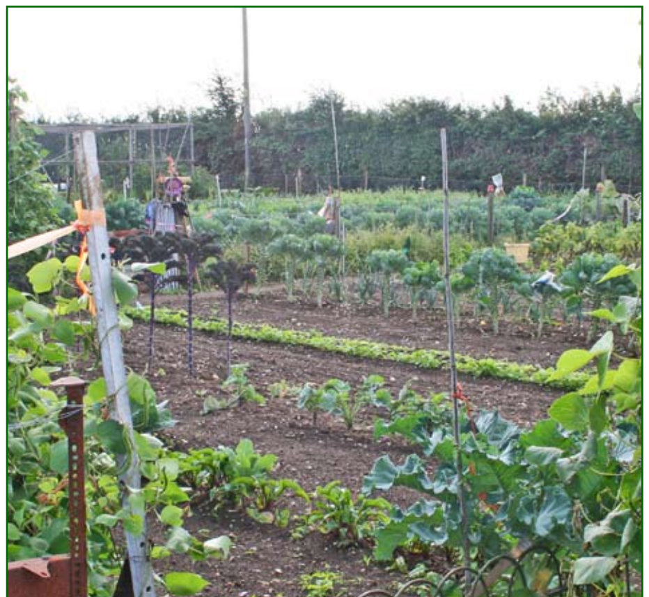
Need for more allotments like this