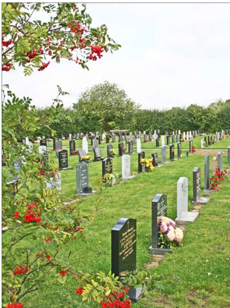
Part of the Rushmere St Andrew Lawn Cemetery

The Parish Amenities and Services Committee meet regularly and its responsibilities include Parish facilities such as Chestnut and Limes Ponds, Tower Hall and Broke Hall Play Areas, Allotments, the provision of litter, doggie bins and notice-boards, the condition of footways and roads, vegetation clearance, litter clearance and grass cutting. Chestnut Pond refurbishment featured high on the agenda although this stalled due to localised flooding. However a series of meetings with various agencies led to a number of actions to mitigate these problems before work could restart. Following significant comment from residents, Council approved a Limes Pond dredging exercise to improve the water quality and associated wildlife amenity.