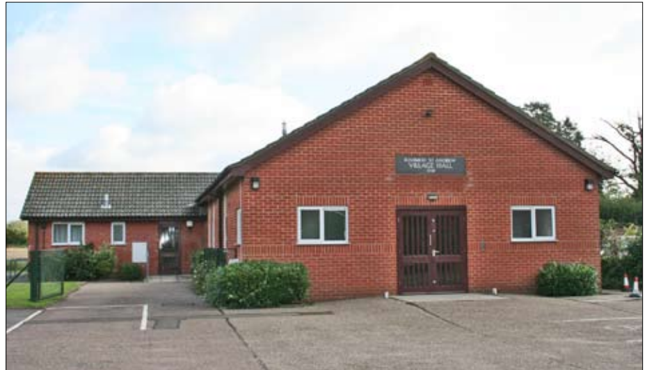
Above Village hall.

Various local groups use the facilities for meetings and the halls are also available for one off events such as children's parties, wedding receptions,