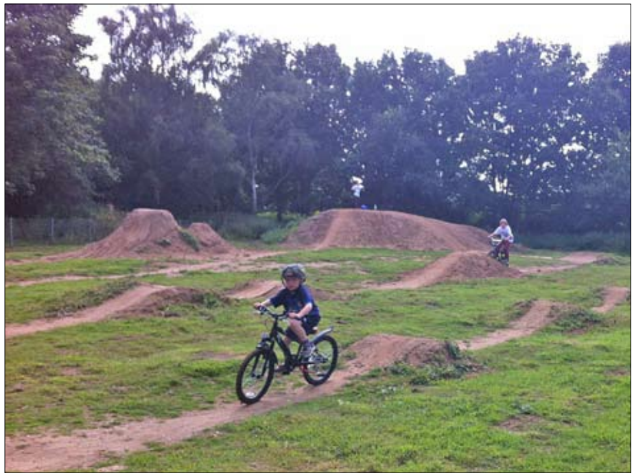
The BMX/dirt jumping track at Martlesham Heath