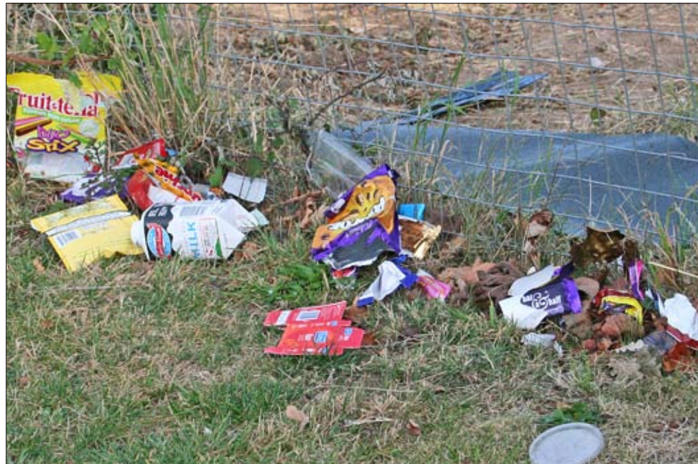
A section of Tuesday morning deposits on Tower Hall play area, and below, fly tipping of garden refuse along Gwendoline Road – see next page

Do you know where your teenage children are during the evening? Perhaps it's time to find out! It's your locality being desecrated and your house value being lowered!