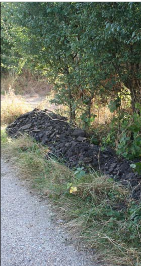
Tarmac scrapings dumped along Gwendoline Road