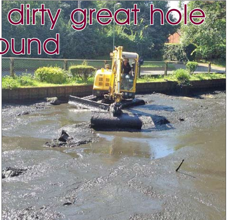
Getting stuck in – almost literally – while clearing the sediment from Limes pond

The pond fencing is due some repair work and there will be a maintenance access gate inserted at the western end. In addition the small garden area within the fenced area is due to be